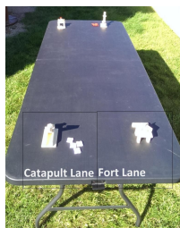
Fig 1 - table set-up

When in doubt, tag us in your Instagram photo @BoardsAndBoxes