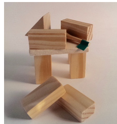
Fig 3 - down