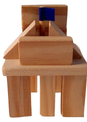
Fig 2 - fort